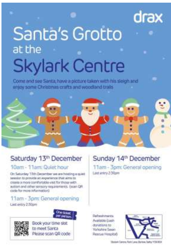
Skylark Centre, Drax. Santa's Grotto Saturday 13 th December (see poster attached)