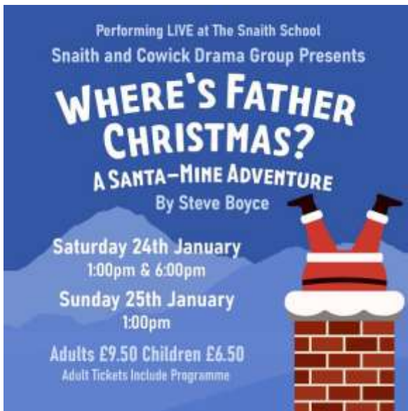
Snaith and Cowick Drama Group Present Where's Father Christmas 24/25 th January (see poster attached)